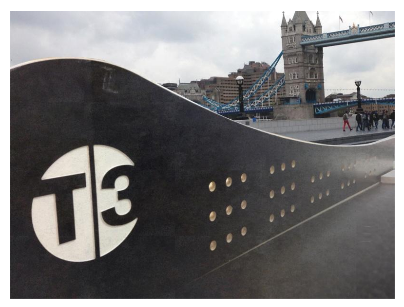
T3 Table Tennis (all weather)