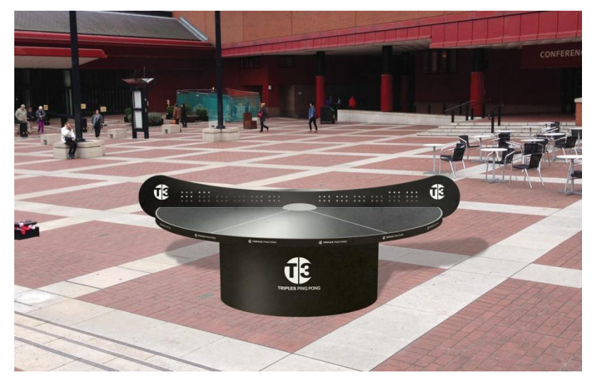
T3 Table Tennis (all weather)